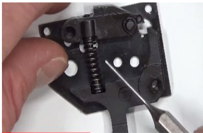
Step 11: Wiggle trigger assembly loose