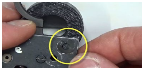
Step 18: Attach C-Clip on otherside