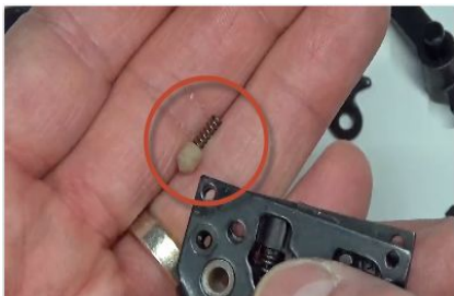
Step 10: Turn over and let detent and spring slowly fall into hand