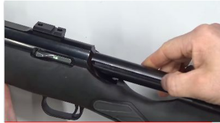
Step 28: Insert bolt