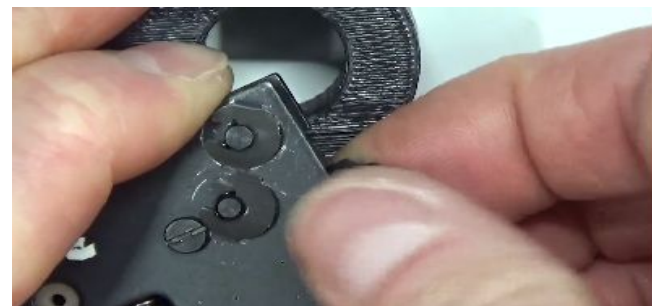
Step 20: Drop longer pin in, attach C-Clip on otherside