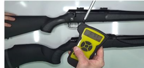
Step 29: Perform a function check