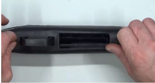
Step 27: Add the stock and take down screws