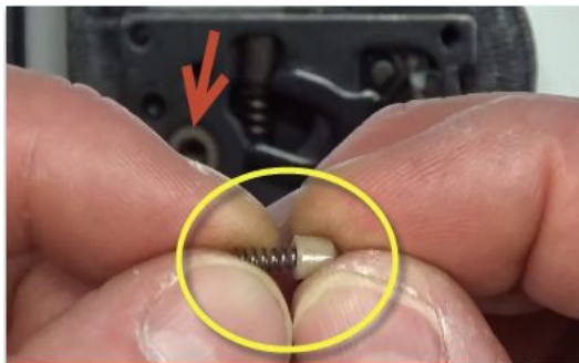
Step 21: Take detent and detent spring and drop it in the hole