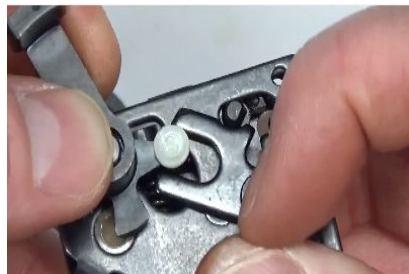
Step 23: Align your level as pictured above