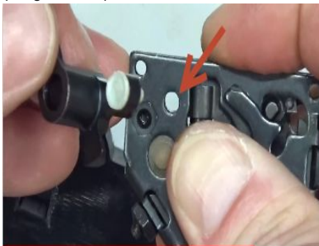
Step 22: Drop your level in the hole