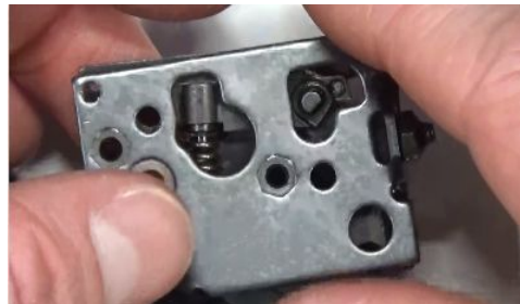
Step 14: Drop the other assembly piece on top. Make sure everything is lined up before you start dropping screws