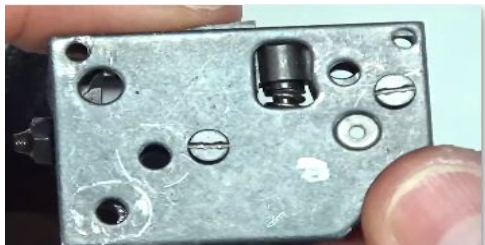
Step 16: Screw the plate screws in