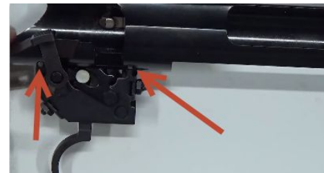
Step 26: Insert take-down pins