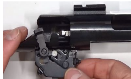
Step 25: Insert trigger assembly back to receiver