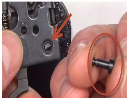
Step 17: Drop trigger hinge pin (fat head, short length) first