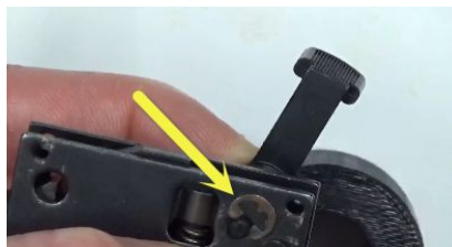
Step 24: Attach e-clip to other side