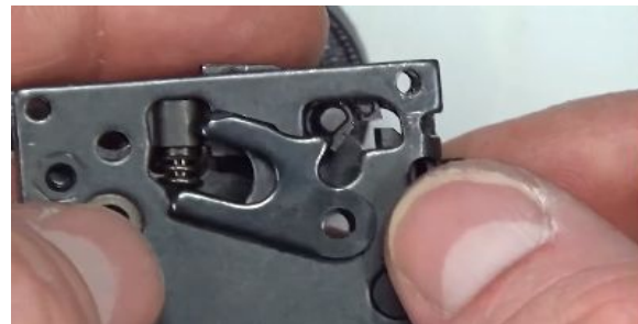
Step 19: Line up trigger safety linkage