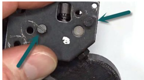
Step 15: Drop in the two plate screws