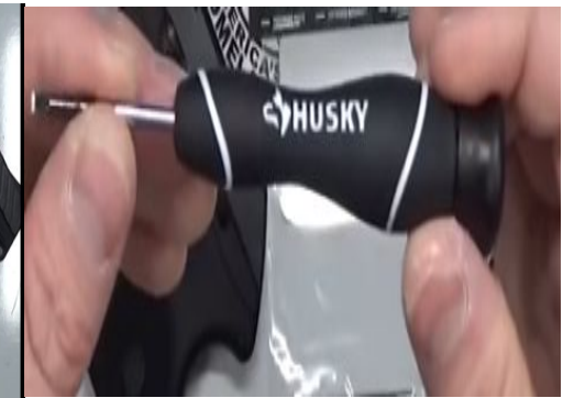
Step 4: Remove factory guide rod from recoil spring