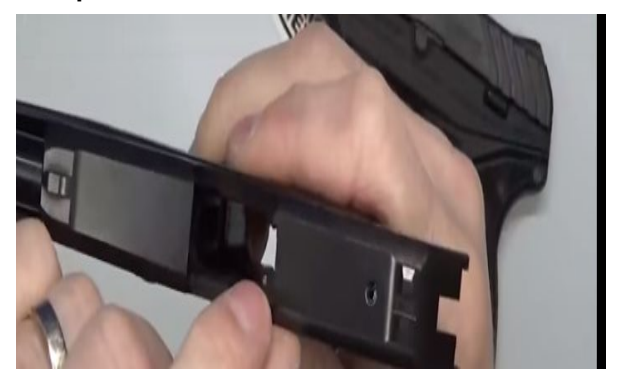
Step 3: Remove the takedown pin